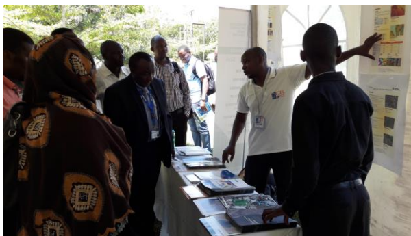
Figure 1: Tanzania GIS Day was organized in Dar es Salaam, Ardhi University on November 15 th , 2017.

We implemented the survey using Harava -crowdsourcing survey tool developed by a Finnish geospatial company Dimenteq ( https://dimenteq.fi/en/services/harava/ ). The survey received 75 full replies from universities, companies, NGOs and public authorities in Tanzania. Also couple of international actors, who have long cooperation in Tanzania, answered the survey.