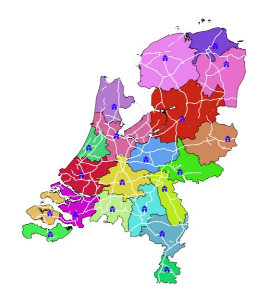
Figure 3: Overlay of Dutch road network, sited facilities, and allocated demand areas.

In order to prove that the facilities have been sited at places with good accessibility, we have overlaid the result of our proposed model on the road network of the Netherlands. Figure 3 clearly shows that the location of facilities and allocated demand areas generated by TpM are placed across major road arteries.