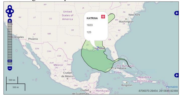
Figure 1: Map of Hurricane Katrina in 2005

The purpose, among other things, is to publish cyclone data as maps such as illustrated in figure 1.