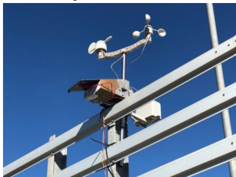
Figure 2: SEnviro node .

Each SEnviro node includes sensors to measure soil and air temperature, soil and air humidity, atmospheric pressure, rainfall, wind direction and speed. A lithium battery of 2200 mA and a solar panel to provide energy for each node, accompanied by energy saving techniques. A 3D model has been developed to protect and join all components. Figure 2 shows an example of SEnviro node .