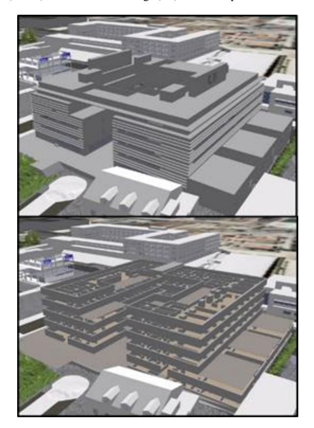
Figure 2: A perspective of the exterior (above) and interior (below) of one of the buildings (C8) of the campus.

To model the interior of the buildings, the architectural design plans were used in CAD format, and georeferenced to the footprint of the respective buildings (Lima, 2016) (Figure 2). All information in CAD format was the only one existing in the technical services of the Faculty since the construction of the campus, and as such, it was necessary its treatment, in particular some editing work, for a correct integration in GIS environment. Already corrected and edited, each floor was modelled in three dimensions, based on the elevation of each floor. The infrastructures were also georeferenced, in a first phase, to the CAD plans and only later they were modelled in three dimensions. In order to associate non-graphical information for all infrastructures and flooring data, a properly structured geospatial database had to be developed. The 3D platform developed is currently managed by ESRI CityEngine software, whose modelling encompasses geometric and semantic components that meet the needs of a university campus, such as FCUL.