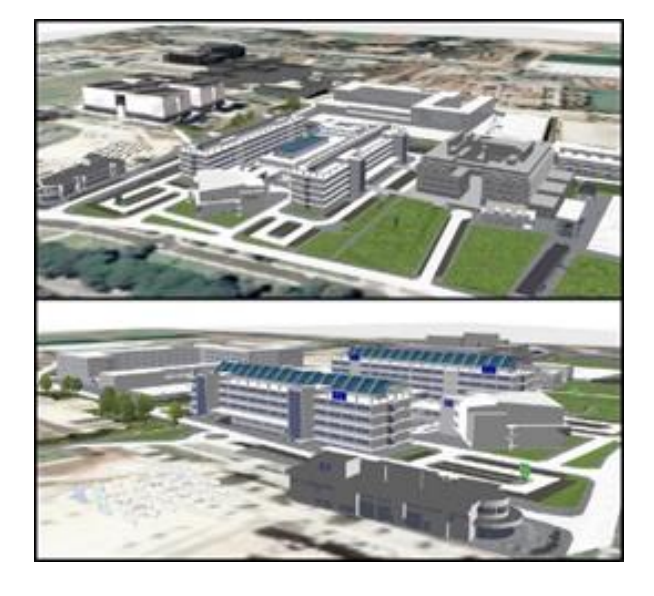
Figure 1: Two different exterior perspectives of the 3D Virtual Campus – FCUL.

buildings were extruded and all their architectural details, such as balconies and windows, were later added based on CAD plans or photographs. The 3D models created with SketchUp were then exported to Collada (.dae) and latter imported into GIS environment as multipatch. The georeferencing process and the integration with the Digital Terrain Model completed the first phase of the project and was the basis for the 3D model of the exterior of the campus buildings (Pereira, 2012) (Figure 1).