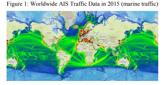
Figure 1 presents the density of the worldwide vessel traffic, using AIS positions acquired by satellite.

In this article, we present a method for the assessment of the quality of AIS messages and the evaluation of geospatial risks associated. In section 2, the AIS is presented along with its geospatial nature and its weaknesses. Then section 3 presents the method for genuineness assessment of the message. Next, section 4 focuses on the spatiality of risks associated with AIS falsification, followed by a conclusion.