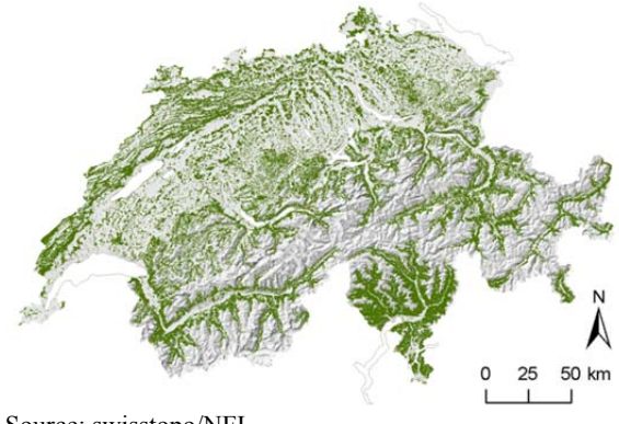
Figure 1: Forest distribution in Switzerland.

In this study, the forest road network in Switzerland is examined and its adequacy for efficient timber transport is evaluated, taking into account that each forest road is capable of carrying only vehicles of a certain maximum size.