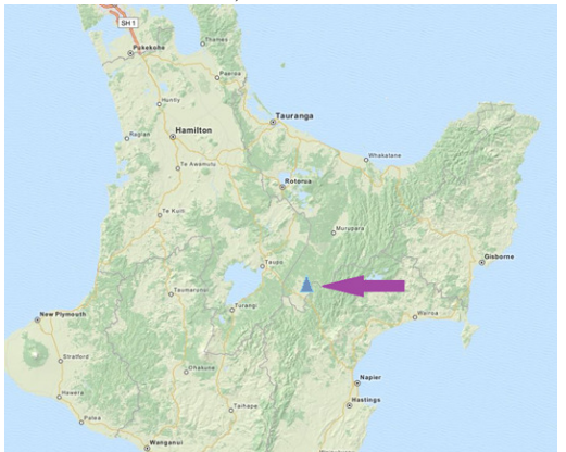
Figure 1: Location of the sensor field site, central North Island, New Zealand.

The prototype site comprises a main station conducting comprehensive measurements of meteorological, hydrological and pedological parameters. For the wireless data transmission within the local site installation XBee-PRO modules from the Digi Company ZigBee IEEE 802.15.4 protocol are used. The main station receives continuous sensor measurements from the attached sensor units, and acts as the gateway to the online SOS and SPS services by providing the communication channel from the local sensor network to the web-enabled data management infrastructure.