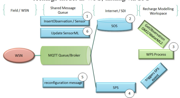
Figure 3: Process diagram, field observations via SOS, recharge model as WPS, tasking via SPS

The data and sensor management is based on SWE semantics and data access is provided via SOS directly, a web portal or a mobile application. Addressing and data transmission is done by a topic string and an arbitrary payload implementing SWE semantics for observations (SOS/O&M), sensor configuration (SensorML) and planning (SPS tasking). The topic string and the payload reflect the OGC operation and allows for a seamless bidirectional communication between the WSN and the SDI. Table 1 lists exemplary translation of OGC SWE operations to the MQTT topic string.