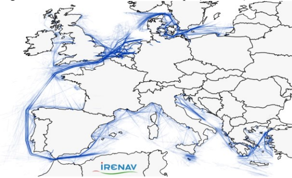
Figure 1: The maritime traffic in Europe (AIS data)