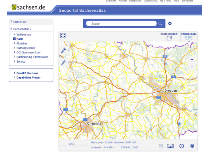
Figure 1: Map client of the Geoportal Saxony.

The test was performed on a laptop with a 15.6'' screen (1920x1080 pixels) using the Web browser Mozilla Firefox. Users' behaviour, in particular mouse interactions and comments, were captured with the software Techsmith - Camtasia .