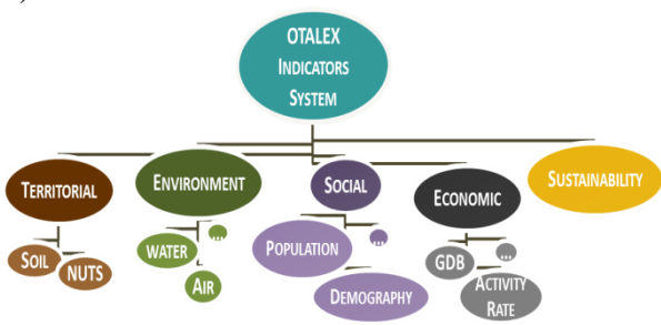
Figure 3: Basic OTALEXC Indicator System (SI-OTALEX

SI-OTALEX C has over sixty indicators grouped into twenty two themes, in turn, the themes, are grouped into five vectors as shown in the figure 3: Territory, Environment, Social, Economy and Sustainability