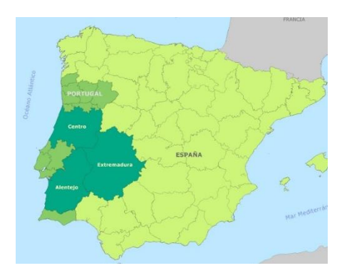
Figure 1: OTALEX C area.

IDE-OTALEX C has developed an Indicator System— SI-OTALEX C, to identify, measure, monitor and evaluate human pressures and its dynamics in the region. The