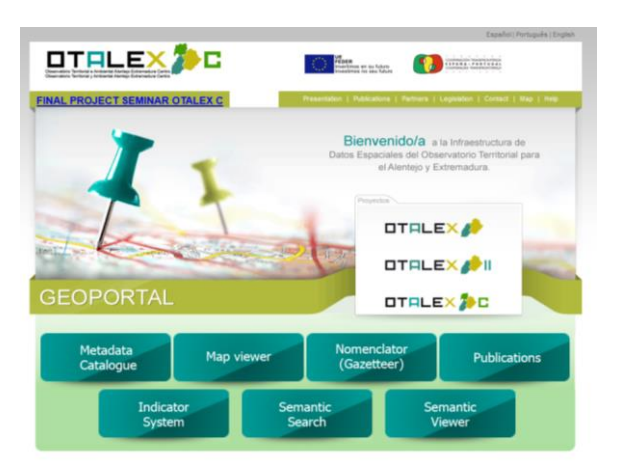
Figure 4: Home page of website IDE-OTALEX C www.ideotalex.eu

IDE-OTALEX C is a distributed, decentralized, modular and collaborative system, based on standards (OGC, W3C, ISO) and open source technology, developed to guarantee interoperability between the different GIS provided by each project partner and OTALEX C itself.