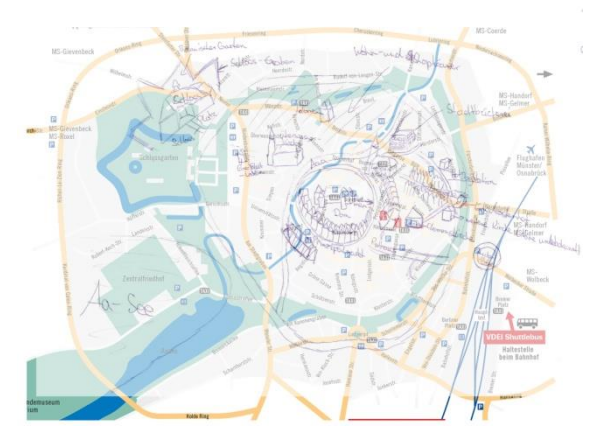
Figure 2: Overlaid sketch map and metric map