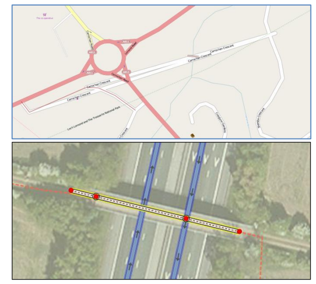
Figure 1: A sample bug: A road spike (above– the white road) and an invalid bridge to motorway connection (below)