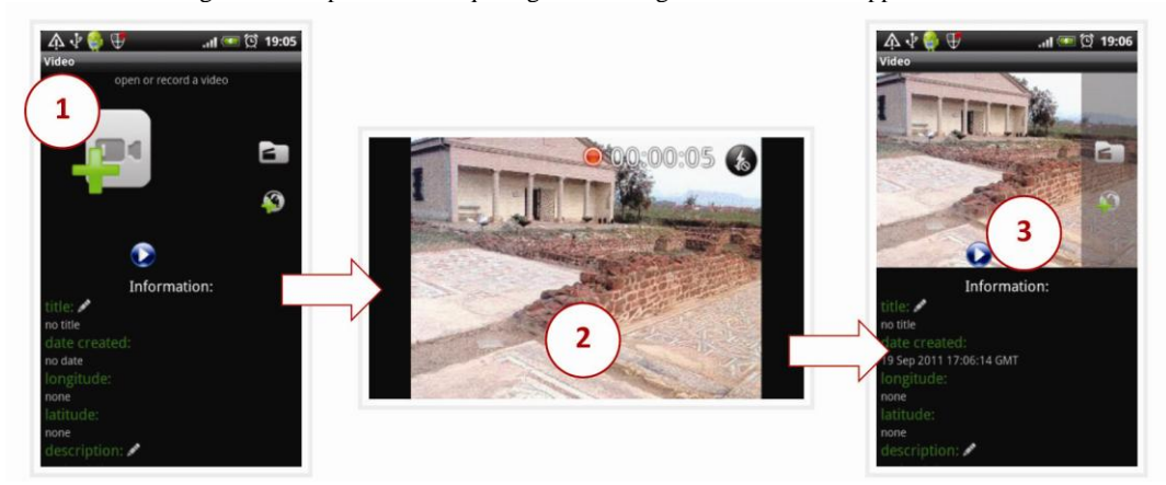
Figure 3: The process of acquiring video using EMdroid mobile application

application the initial screen is presented to the user allowing her to choose which type of data she wants to create. The application uses native Android providers for camera, microphone and keyboard. The process of acquiring video using EMdroid application is shown on Figure 3. User starts video capturing by selecting camera icon. The installed application for capturing video is presented to the user. Upon capturing the content, the user initiates the process of acquiring location using native Android location capabilities. If for any reason the actual location cannot be acquired, the map is presented to the user on which she can select her approximate location by tapping.