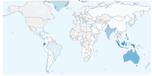
Figure 2 – An example of visualisation of the tweets distribution for a specific term

To navigate within the hierarchy by using OLAP operators. For example, it is thus possible to know the set of the most specific terms for a city, a region and a country.